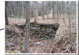
STONE FOUNDATION Foundation remains of a 1800s sawmill