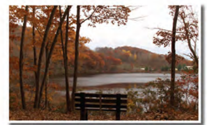
LANTERN HILL POND

ENJOY THE VIEW FROM LANTERN HILL Follow a steep climbing trail and be rewarded with a beautiful view. Lantern Hill has been referenced back to 1653, suggesting its importance as a signaling or gathering place first to Native People, later to the English. There is also archaeological evidence indicating the presence of Native People as far back as 10,000 years ago. Elevation: 491' above sea level.